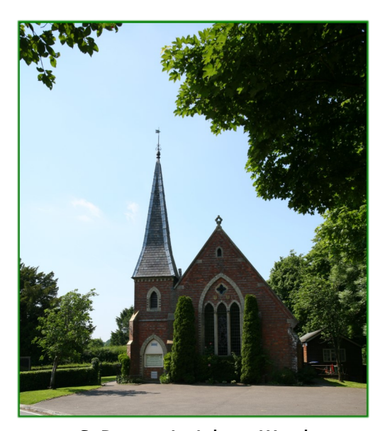
St Dunstan's, Ashurst Wood