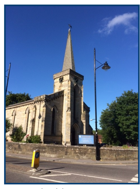
Holy Trinity, Forest Row